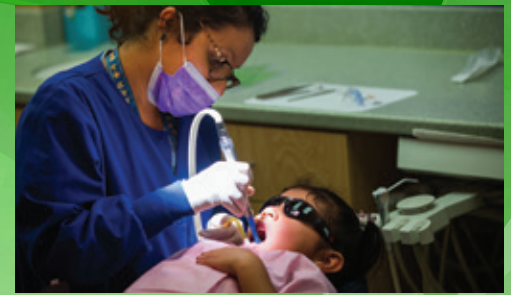
Patient receives annual checkup at the Community Clinic in Springdale.