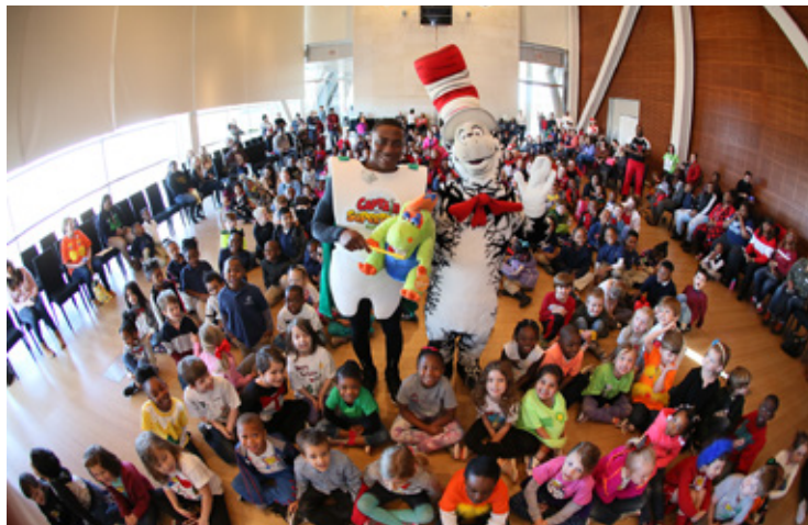
Captain Supertooth teaches local elementary students about the importance of brushing with Dr. Seuss' Cat in the Hat during National Read Across America Day at the William J. Clinton Presidential Library.