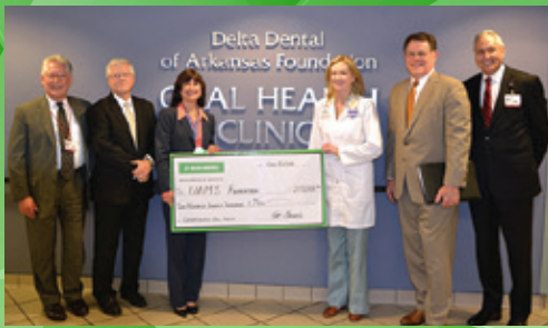
University of Arkansas for Medical Science Oral Health Clinic.