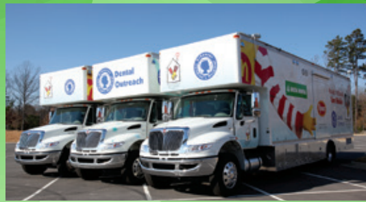
Arkansas Children's Hospital Mobile Dental Clinics.