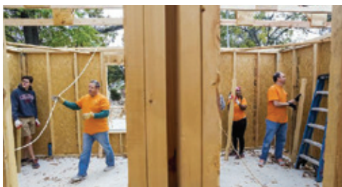
Delta Dental employees volunteer with Habitat for Humanity of Central Arkansas.

At the Delta Dental “Dental by 1” area, March of Dimes employees and volunteers provided educational materials to 1,600 families about the importance of visiting the dentist within six months of getting the first tooth — and no later than the first birthday.