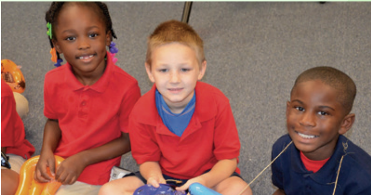
Students from Meadowcliff Elementary at the announcement of Bright Smiles, the Little Rock School District's (LRSD) new school based oral health education initiative.

The Bright Smiles program, which coordinates basic oral health screenings and fluoride varnish treatments for pre-kindergarten to 5th grade students across 25 LRSD schools over the next three years, will impact nearly 11,000 students in the District.